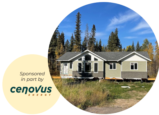
This home was delivered in July 2022 to a single mother with three children.