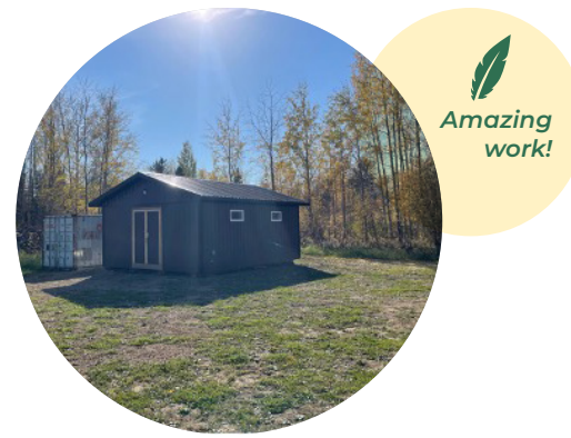
Chelsea Lacombe & Odell Fontaine built this shed.